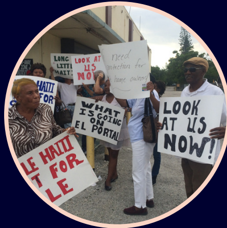
FIGHTING FOR THE FUTURE OF OUR NEIGHBORHOODS