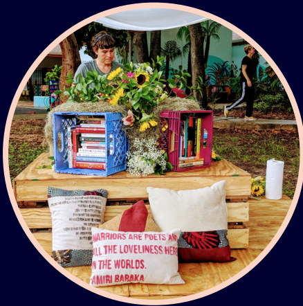
ART x SOCIAL JUSTICE: MAROON POETRY FESTIVAL