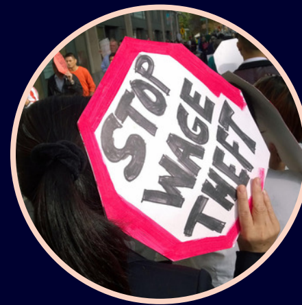
FIGHTING WAGE THEFT