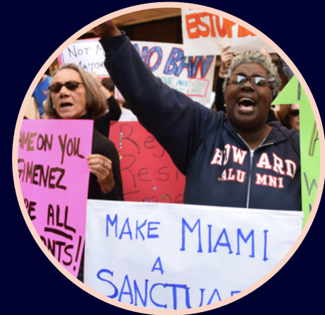
MAKING MIAMI WELCOMING TO IMMIGRANTS